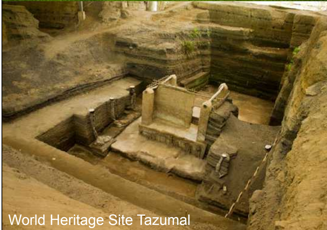
World Heritage Site Tazumal

El Salvador is home to Mesoamerican cultures, with Mayan and Olmec influences.