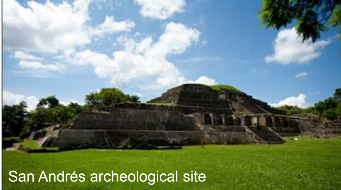
San Andrés archeological site