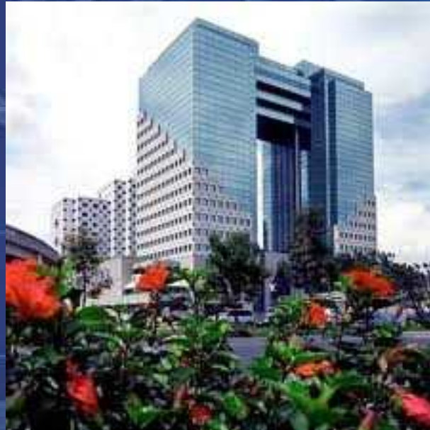
Universidad Rafael Landívar