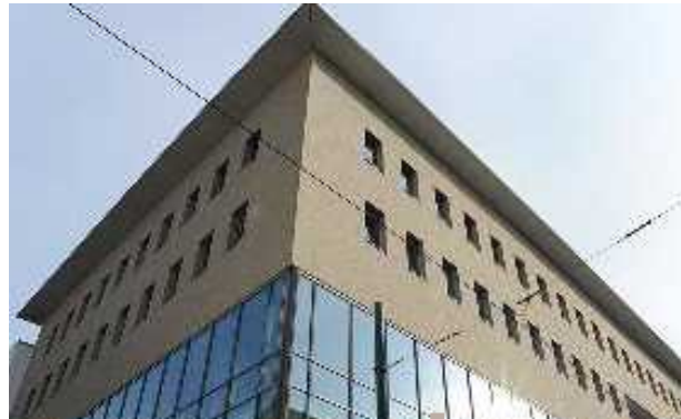
campus L. Nieuwstr.