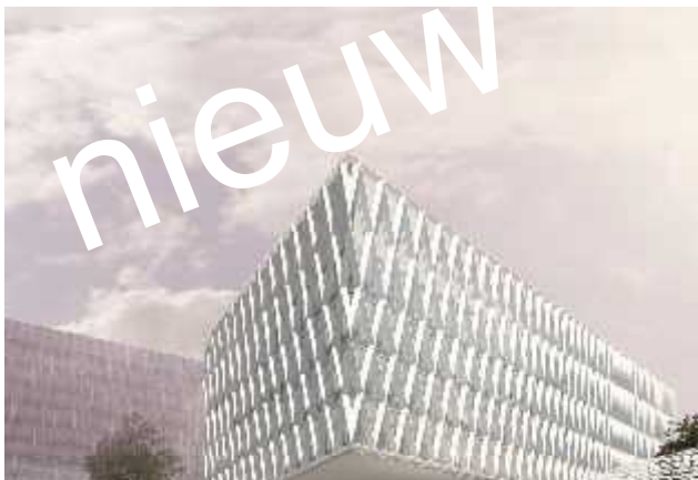
campus Spoor Noord (2015)